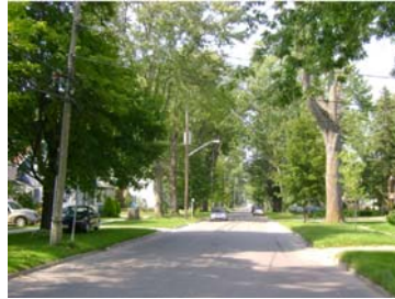
Figure 2: View of main collector street from an established residential neighbourhood within New Tecumseth.

Second, an UDR indicates clearly how the vision will be achieved in detail by the proposed development, such as by providing home model details that promote historic contextual design, in accordance with principles, objectives and standards set out in the report. The UDR should be written to provide clear direction that can be implemented and monitored in the final design and development stages (i.e. Engineering Drawing Submissions).