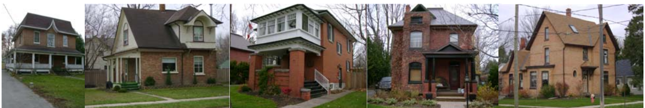
Figure 1: Photos of existing housing from established residential neighbourhoods within New Tecumseth

First, it identifies an overall design vision for the proposed development that is unique to the site and complements, enhances and fits within the context of the site and its surroundings. The vision and how it will be created should be fully described in the UDR. For instance, the vision may draw from the character of existing housing and