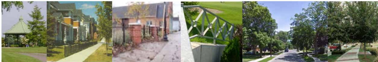
Figure 4: Enhancement Photos