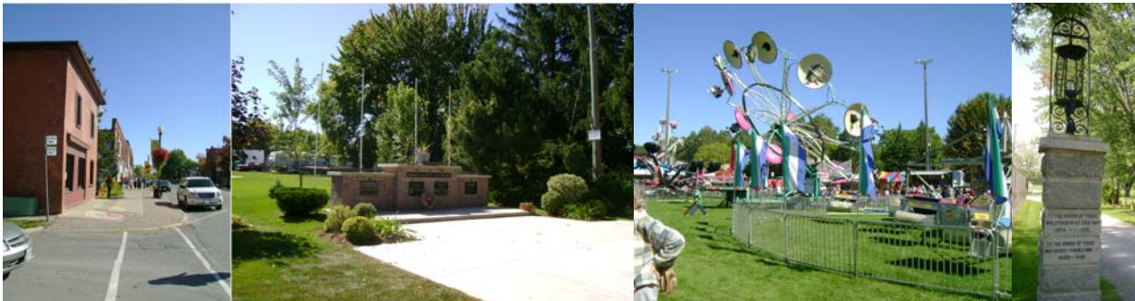
Figure 3: New Tecumseth Character photos

In the preparation of an Urban Design Report we recommend consultants have a good understanding of the Town of New Tecumseth, the proposed development site and features that are available in the context of the site. In addition to completing a community tour and site context inspections, we recommend a thorough review of the Town's website ( www.town.newtecumseth.on.ca ), which provides the Town's Strategic Vision, Site Plan Submission Guidelines, departmental policies, by-laws, current activities, and other relevant information that will help in developing ideas and the vision for the proposed development. For instance, in its Strategic Plan: Building on the Foundation, the Town of New Tecumseth recognizes the unique rural and small town character of the Town, which is precious to its residents and requires that it be maintained. As an example the photos in Figure 3 are intended to illustrate some of this special character you find in the Town.